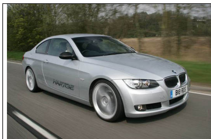
Birds E92 335i demonstrator

(Quaife differentials are available for all BMW models)